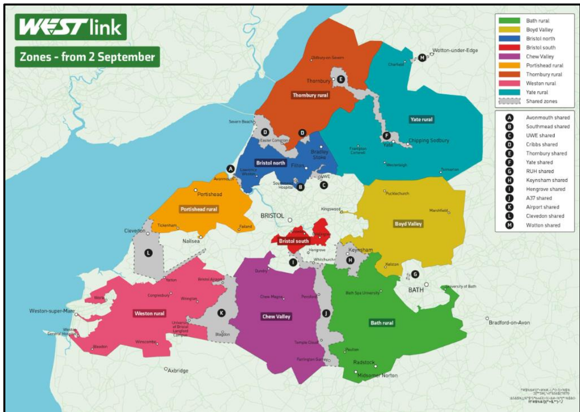
WESTlink Operational Zone